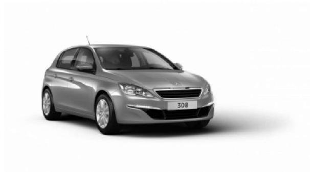
Photo of a similar vehicle or model